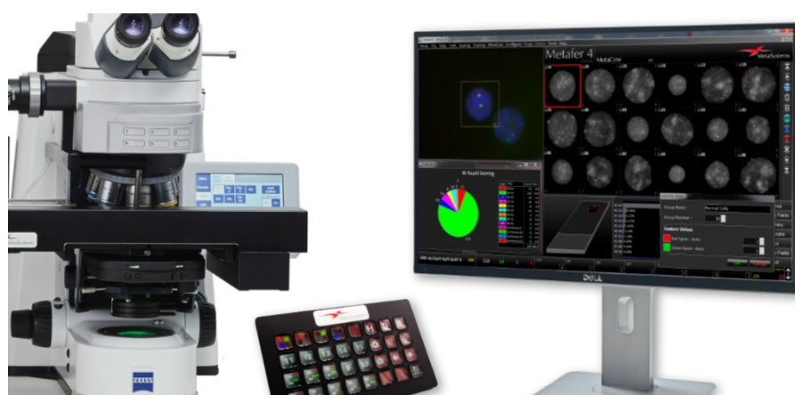
Figure 3: With the Rapid FISH Spot Workflow, the expert interactively checks the spot patterns using the RapidScore keyboard (shown in the center of the image). The keys of this device automatically adapt to the arrangement of the FISH probes, allowing the user to confirm or correct the automatic proposals with just one keystroke.

[1] Maxim Asanov, Stefano Bonassi, Stefania Proietti, Varvara I. Minina, Carlo Tomino, Randa El-Zein (2021) Genomic instability in chronic obstructive pulmonary disease and lung cancer: A systematic review and meta-analysis of studies using the micronucleus assay, Mutation Research/Reviews in