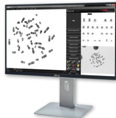
Figure 2: The screen shows the Ikaros software, which uses artificial intelligence to provide karyogram suggestions rapidly and reliably for the expert's review.

procedures, perfect organization of workflows, and expert knowledge for evaluation.