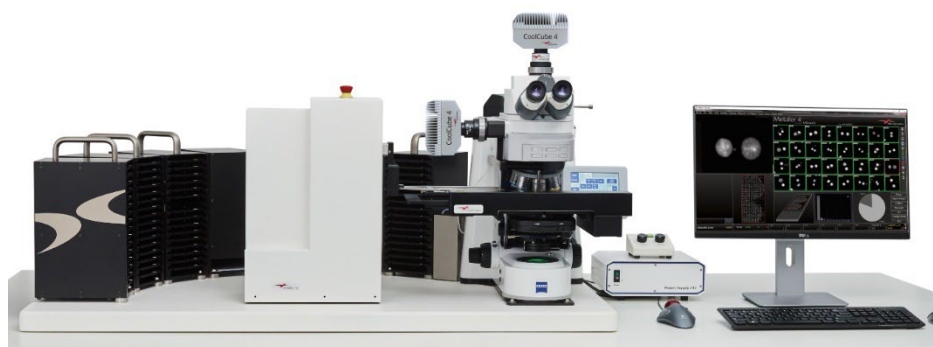
Figure 1: Fully automated scanning system run by the Metafer software. The installation shows an application-specific adaptation to the in vitro micronucleus assay. Hardware add-ons for high-volume scanning allow unattended scanning of up to 800 slides.

prevention, early detection, and timely and high-quality treatment. World Cancer Day is an international day celebrated on February 4 to raise awareness and fight against the unequal distribution of detection and treatment options, any form of misinformation, and stigmatization.